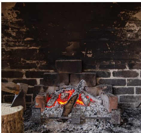
Creosote builds up inside the chimney.

The time to test and prepare your heater or furnace is now. Change your HVAC filter if you haven't done so in a while. This is also a good time to ensure both the intake and return vents are clear and free of debris. Test your heater by turning it on just enough for the unit to start up. You should be able to feel the warm air issuing from the vent or register within a minute. If the unit fails to heat, have it serviced. At least once every few years, you should schedule an HVAC checkup by a licensed technician. This will guarantee your unit is ready and running efficiently before the cooler temperatures arrive. Portable and wall mounted electric heaters are common items in today's households. It is important that these be cleaned and tested prior to vigorous use. Portable heaters should be equipped with auto-shutoff features triggered by either a time interval or in the event they tip over. These features should be tested. If any of the shutoff features fail or you have an older unit that does not have them, you should consider replacement to ensure maximum prevention of a fire emergency.